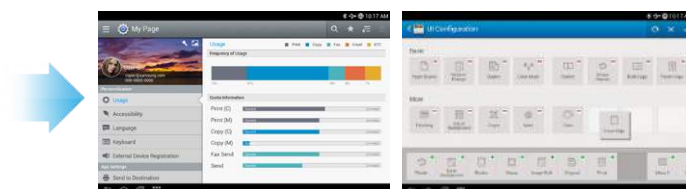
UI Personalization (My Page)

Applications are preloaded, including Copy, Scan/Send, Box (Document Storage), Job Status, Counter, Settings, Build Job, Address Book and Help, which provide users with more convenient usability. In addition, there are custom widgets for creating instant, one-touch access to frequently used functions.