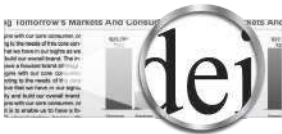
De-ICE (Integrated Cavity Effect)